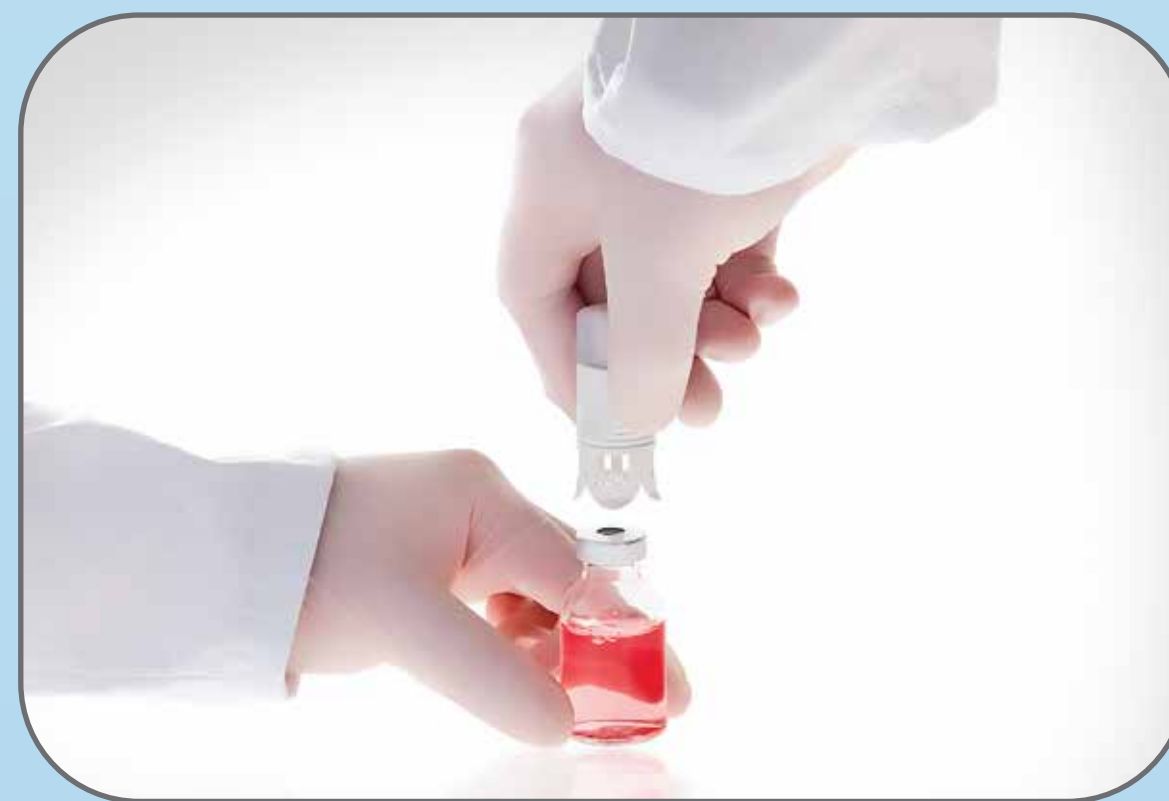
Figure 1. This shows the Tevadaptor vial adaptor being fitted to a glass vial.

This study tests whether the Tevadaptor® CSTD (Figure 1) can be used to extend practical shelf life of drugs by maintaining microbiological and physicochemical integrity when multiple withdrawals are made from non preserved single use drug vials.