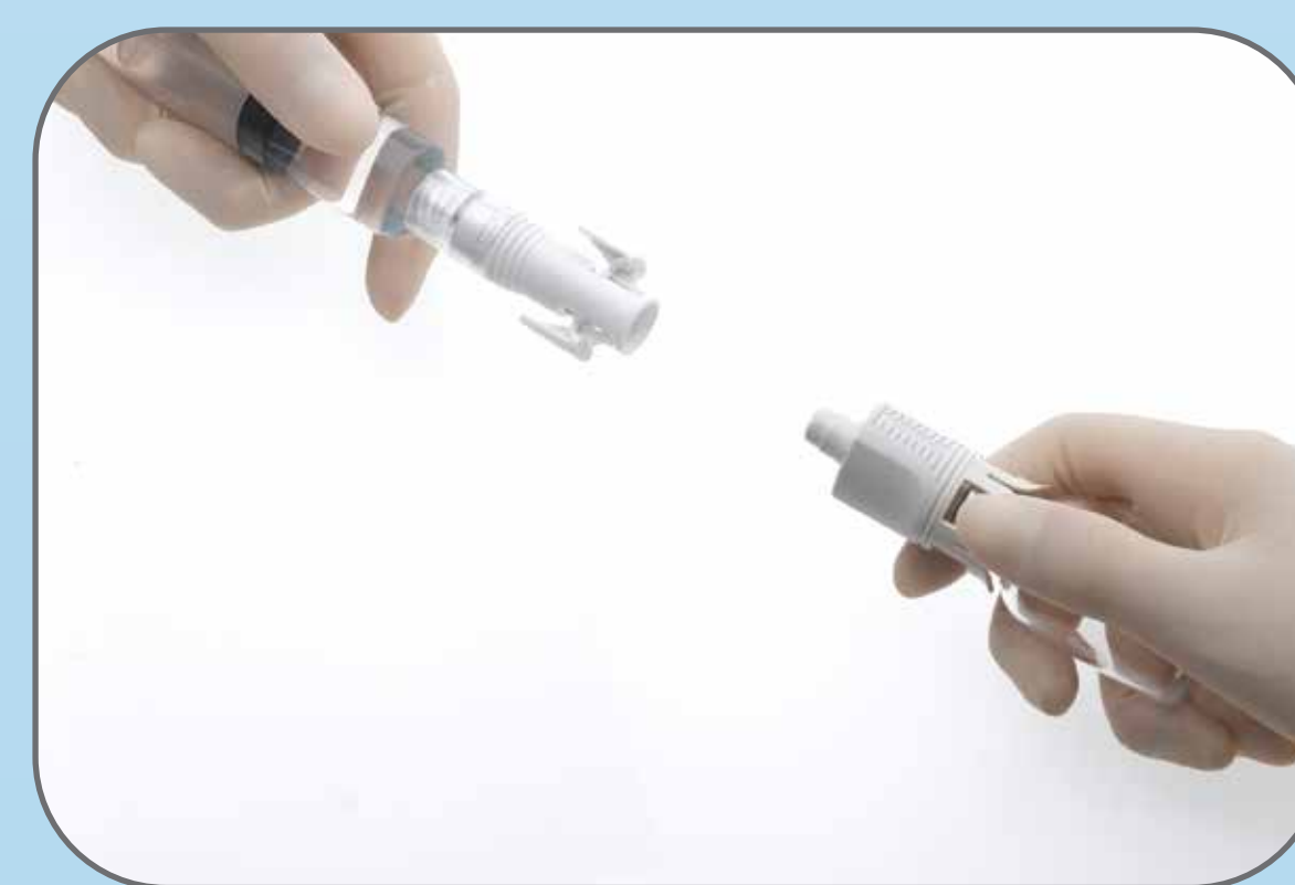
Figure 2. This shows the push and click ease of use when attaching a Tevadaptor syringe adaptor to the vial adaptor for making a withdrawal from the vial.

With the increasing pressure on hospitals to reduce the drug cost burden, the hospital pharmacist is challenged with identifying means to reduce drug wastage, without impacting drug safety or efficacy [2]. The data presented in this study may be used by the pharmacist to help support the decision to extend the practical in-use shelf life of drug products when used with the Tevadaptor® system.