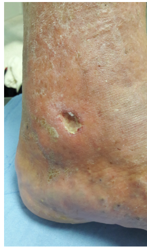
Before use of Prontosan® Debridement Pad