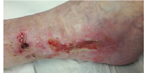
3 weeks post debridement