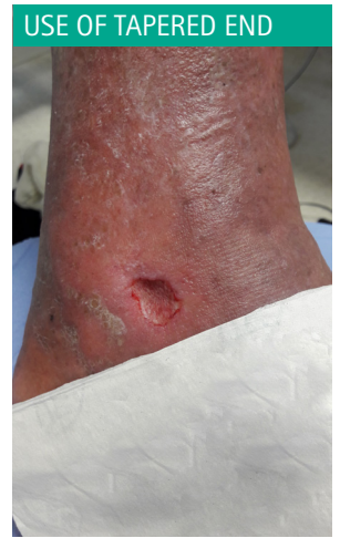
After use of Prontosan® Debridement Pad