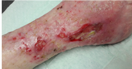
After a single debridement